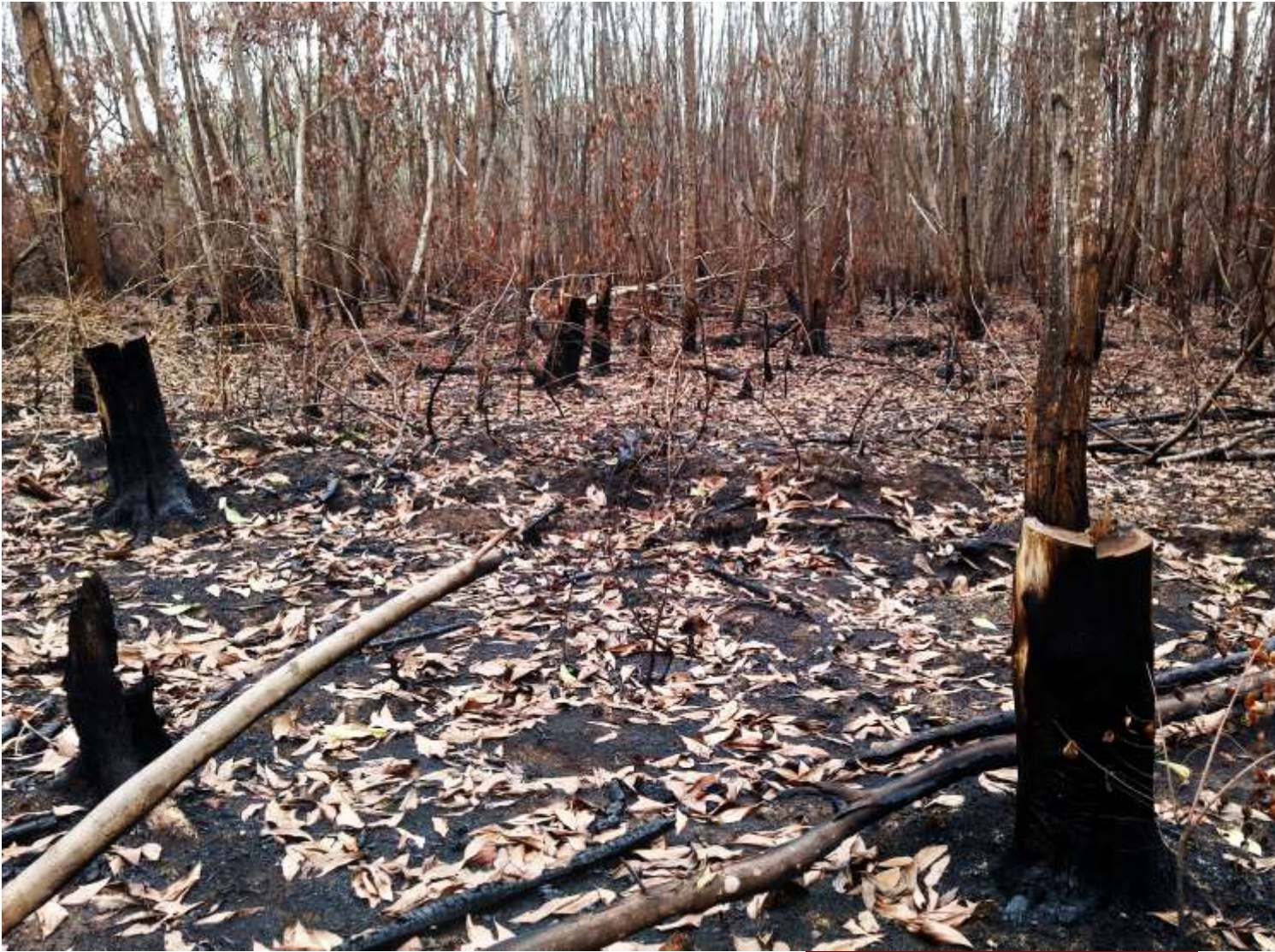
103°52'46.21"E 01°54'24.19"S – 16 November 2015

APP's FCP-based supply chain will become increasingly obscure if timber from a pulpwood plantation that has been developed in a legally-established HCVF area continues to be harvested so as to supply APP's mills.